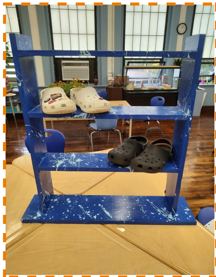
Joelina's shoe rack